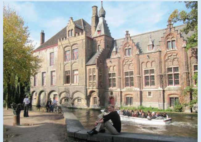
The Canals of Bruges